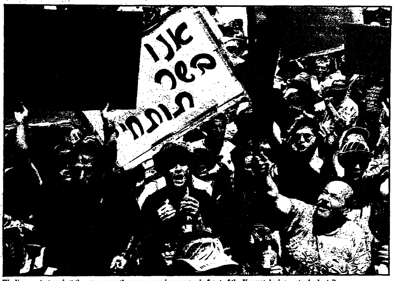
Workers protest against the government's new economic program in front of the Knesset during yesterday's strike.

MOST of the public sector shut down yesterday, as some half a million workers struck to protest against the government's economic program. Histadrut Chairman MK Amir Peretz warned that unless the government revokes the economic measures, the Histadrut will continue its campaign against them. Histadrut and union leaders promised to "drive the government and state crazy" and strike a different sector every week, until the government revises its economic decisions. Foreign Minister David Levy attacked the government for economic decrees he said harm workers and criticized it for not negotiating with the workers' representatives. He called on the government to talk to the representatives and come up with an economic plan with them, rather than dictate to them. Levy expressed fear that unless the government does so, it will not be able to carry out its privatization plans. The strike, called by the Histadrut, encompassed most of the public sector, government ministries and corporations, public summer schools and day-care